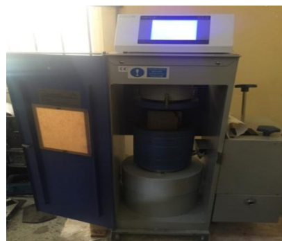
Fig -3: Crushing of cubes