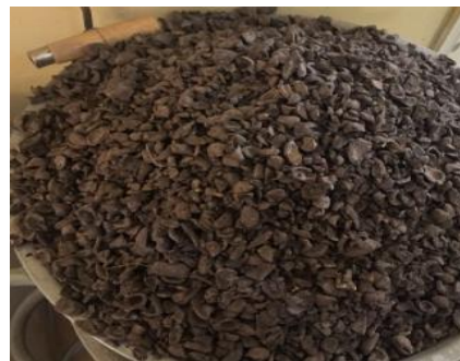
Fig -1: Heaped palm kernel shell