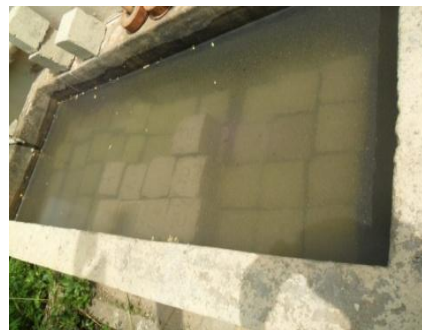
Fig - 2: Curing of concrete cubes